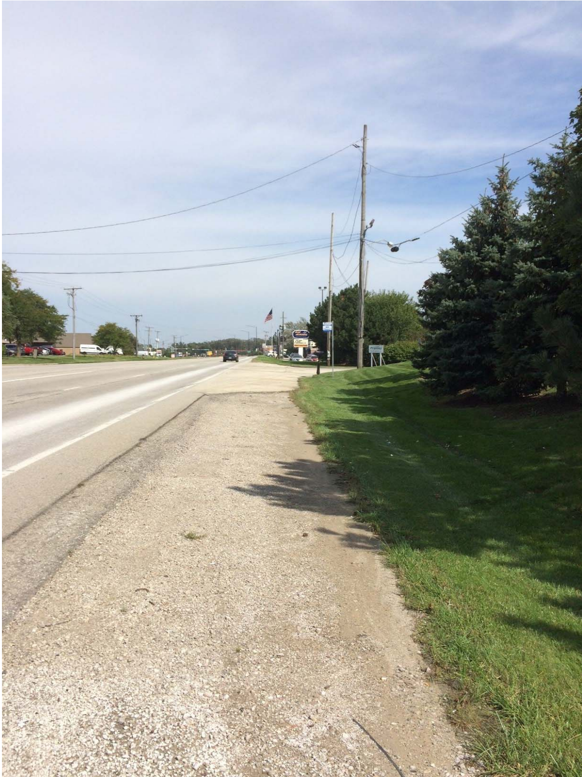
Existing sign facing north from 500 Ft. away