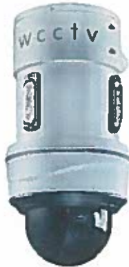
4G IR Mini Dome